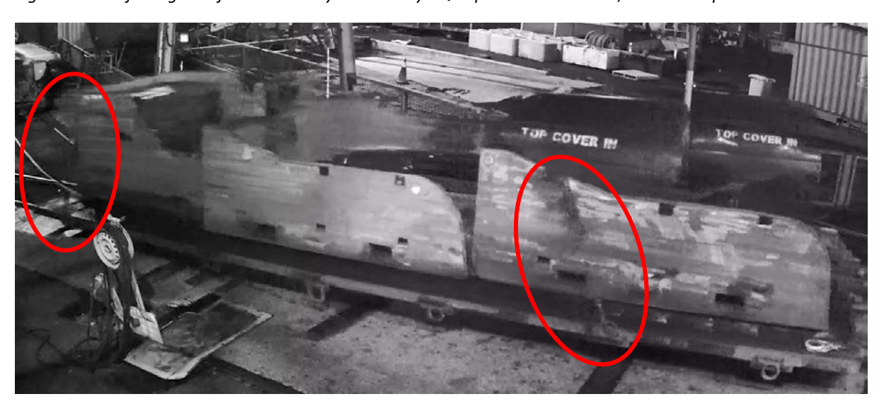
Figure 3 video footage confirmed the inbye and outbye QDS pods were chained, the middle pod was not.

Video footage of the dolly car on the surface was used to determine the sequence of events leading up to the incident. Witness statements from the dolly car driver, surface yard person, fitter, and two workers at pit bottom were reviewed, along with an interim report by the engineering team on the damage to be repaired. The drift was inspected around 32 man hole, and from the pit bottom shunt to the inbye pod near drift bottom.