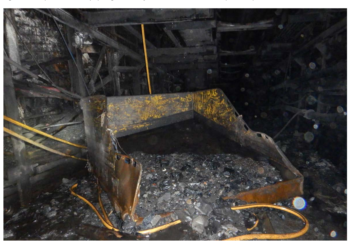
Figure 1 QDS pod arrested by spillage near drift bottom. It had travelled past the pit bottom shunt

Whilst transporting three QDS pods (ducksbills) into the mine on a rail flat top attached to the dolly car two of the pods detached and slid uncontrolled down the drift. There was no one in the drift at the time of the incident and no one was harmed.