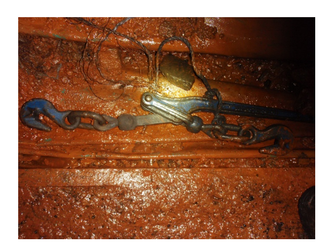
Figure 4 chain dog found 8m inbye 28 man hole