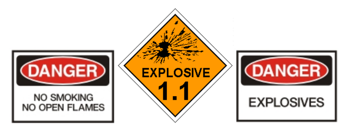
Figure 1: Signs to be marked: No Smoking sign, Explosive hazard class diamond, and Explosives sign.