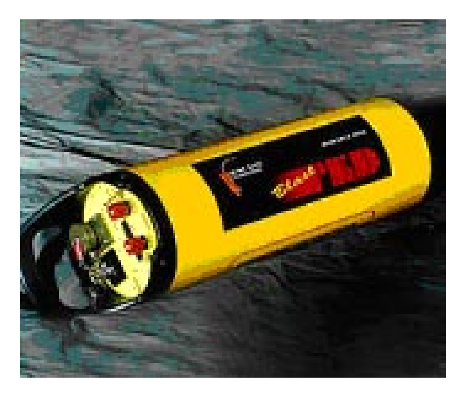
Figure 5: Underground remote blasting using BlastPED system.