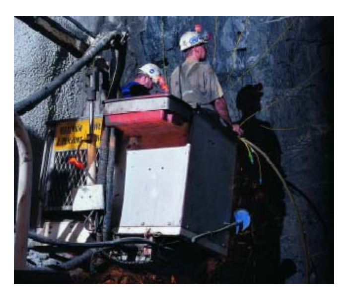
Figure 3: Charge car basket with receptacles for explosives