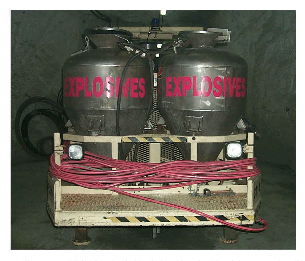
Figure 2: Charge car with kettles clearly labelled and blue flashing light mounted on drivers cabin